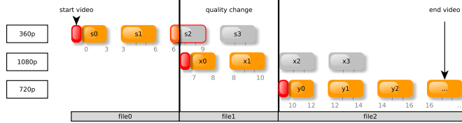
Fig. 2. Example of assembling a video stream; three different quality switches occur during video play-out and reassemble video files for our analysis.

transparently. After the selected video has completed playing, all data from the client side is stored (player load time, startup delay, video duration, average stalling duration, stalling events, quality events), and the analysis of the recorded man-in-the-middle dump is launched. Our analysis step assembles all segments into different video stream files and aggregates all stored and required video properties for the quality model.